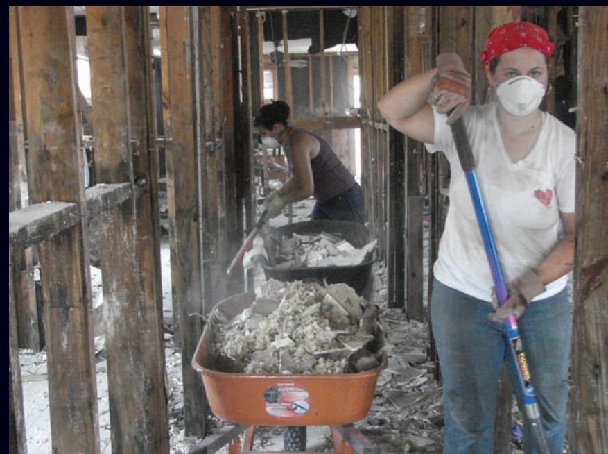
Nearly 700 volunteers from around the nation and the world have devoted over 7000 volunteer hours to gut more than 600 homes – providing $3.3 million in services to homeowners in need.