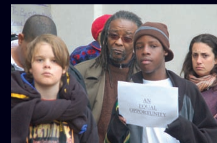
The Homecoming Center at St. Luke’s supports student leaders fighting for improved education and runs learning workshops for young people with special life challenges. Here, members of the Fyre Youth Squad accompanied by the church’s community organizer make abysmal conditions known at the State Capitol in Baton Rouge.

It begins with a heart full of love and a soul full of grace... Service gathers community... Compassion becomes contagious... It can even change a city... When we become the change.