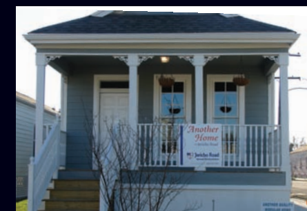
The Jericho Road Housing Initiative of the Episcopal Diocese is building beautiful affordable homes for low-moderate income families in blighted Central City. 52 lots have been preliminarily awarded to the church by the city to be built in 2007.

“Create affordable homeownership opportunities”