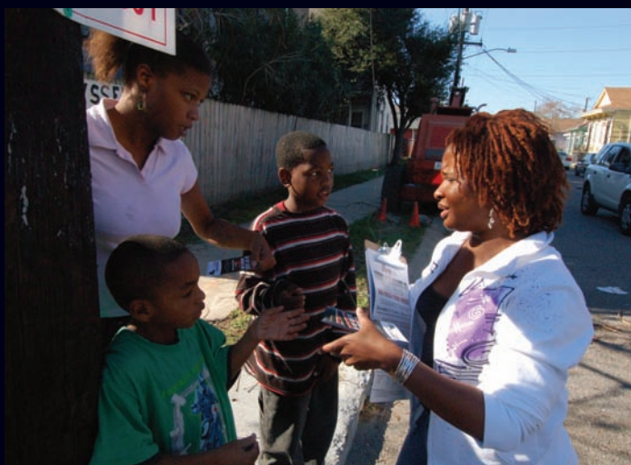
Four Homecoming Centers support the strong resurgence of low-moderate income neighborhoods: Direct services stabilize lives; Training empowers leadership; Community Organizing fights for equitable economic redevelopment and the just delivery of recovery resources.