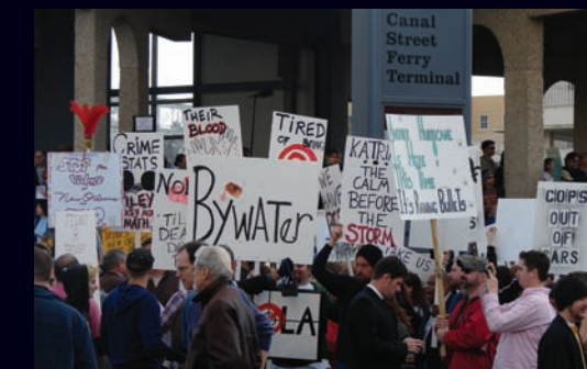
Our organizing efforts helped gather 6000 citizens from all neighborhoods to join the March for Peace on Thursday, January 18, 2007.

“Create living-wage jobs, especially for young people”