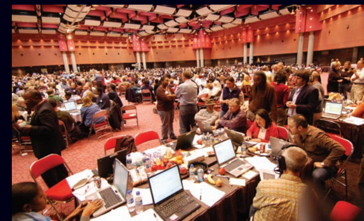
Our Church helped recruit 4800 citizens for Community Congress II and III: 64% African-American, 25% with incomes less than $20,000.