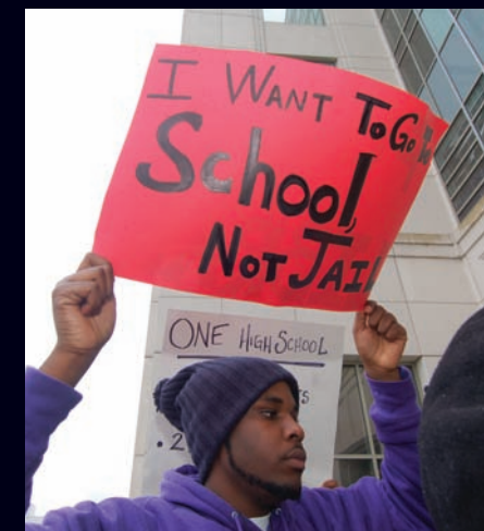
The Episcopal Diocese recognizes the connection between inadequate education, lack of economic opportunity and crime. Our work in two of New Orleans’ most challenged neighborhoods is deliberately holistic in its approach and particularly seeks to reach “at-risk” youth with opportunities for educational and economic advancement.

“Create living-wage jobs, especially for young people”